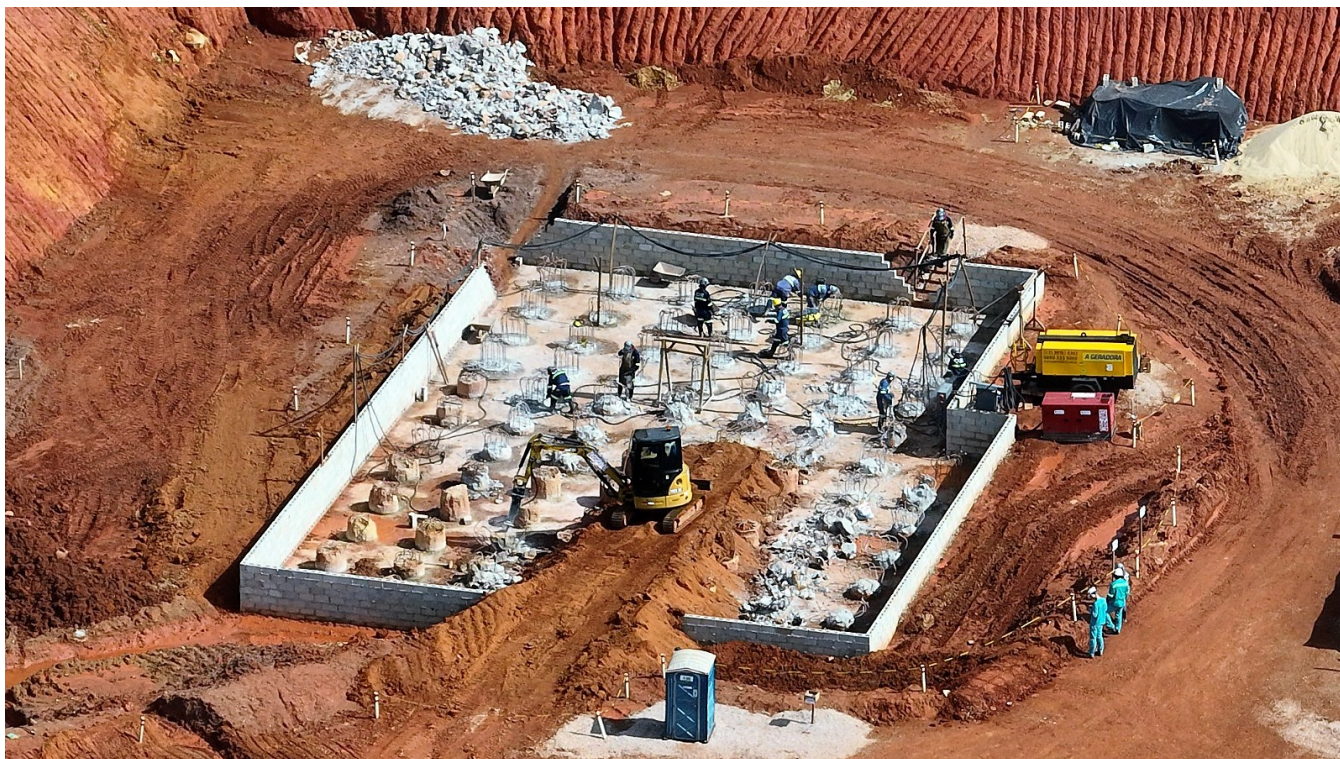
Figure 2: Civil works underway at the Tucumã Project's primary crushing area (April 2023).