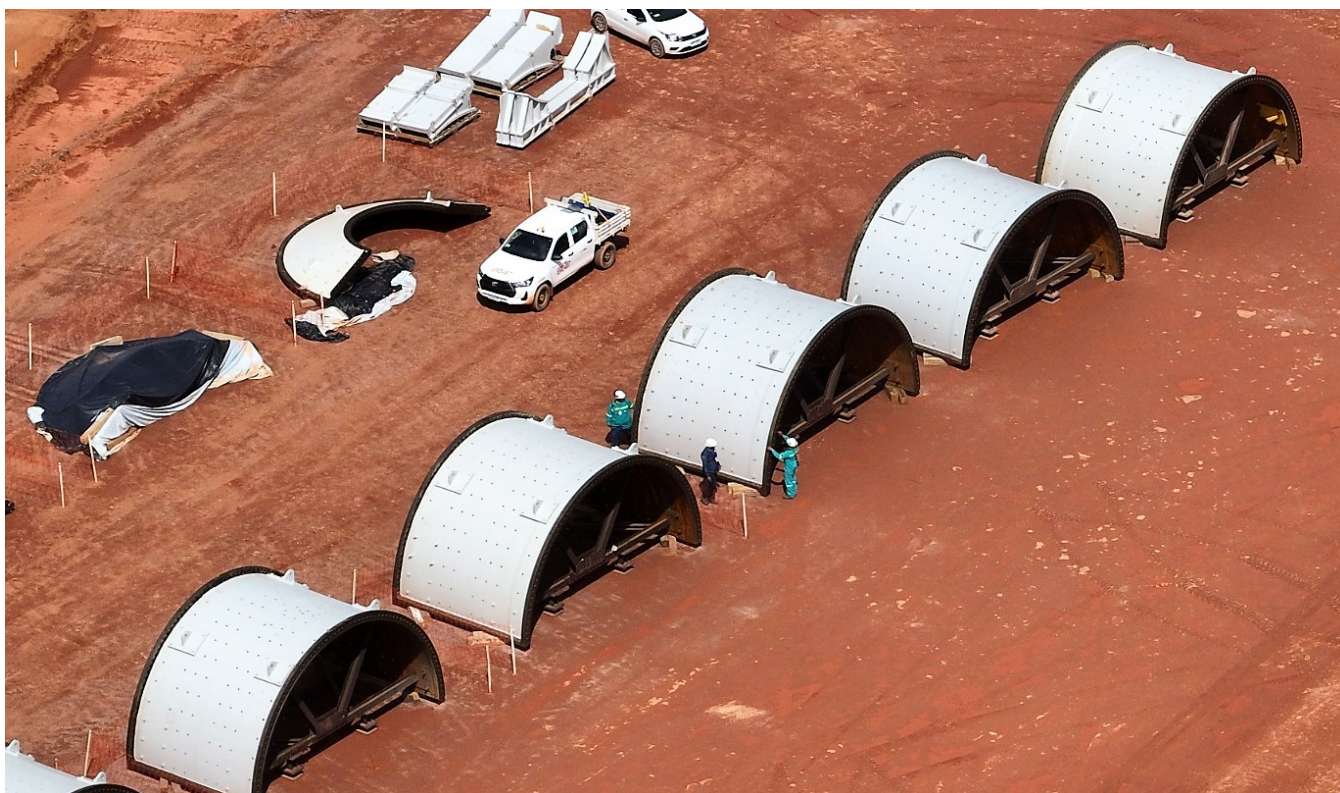
Figure 3: Ball mill components upon arrival at the Tucumã Project (April 2023).