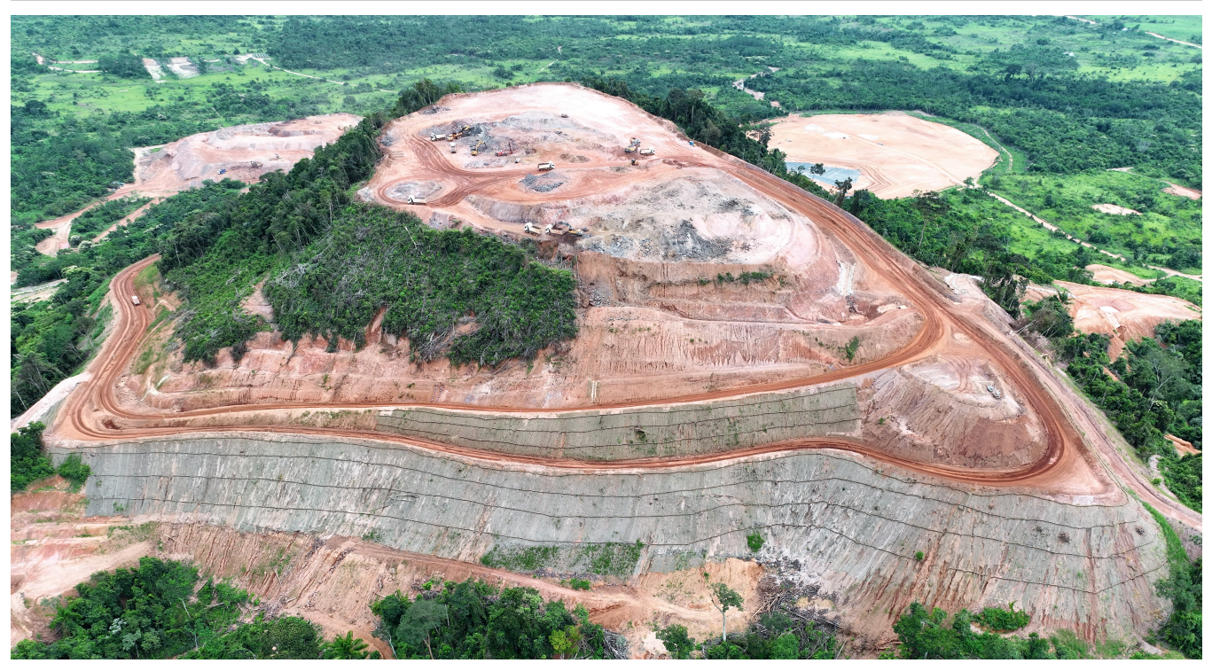
Figure 1: Tucumã Project pre-stripping progress (February 2023).